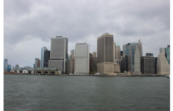
The southern tip of Manhattan known as the Battery. Much of what you see is “reclaimed” land.

What are the strengths and weaknesses of each approach - digging canals and bringing the water in or building the island outward into the river - and how do they affect us, today? Which, if any of these approaches played a role in the development where you live?